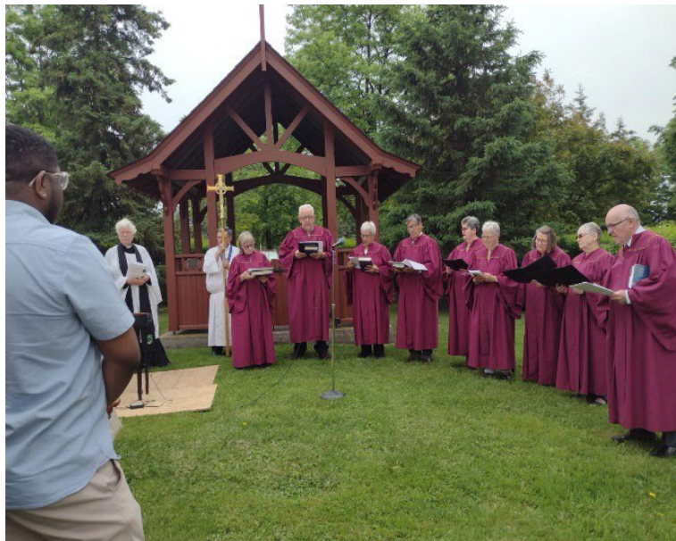
Music for Memorial Day 2025

For this important annual service, we invite families to join us for a remembrance of the souls that have found rest in our hallowed grounds. This is a time to congregate and to reunite with friends and worshipers, present and past. It is a key fund-raiser for the Cemetery Board.