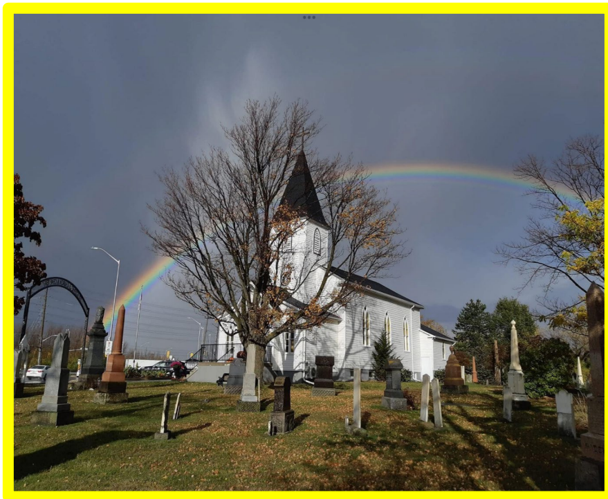
God's Glory shines over St. Stephen's

Our churchyard was established in the 1830s. It is operated in full compliance with Ontario law. The remains of many of Hornby's Victorian- era pioneers are here. It is interesting to walk amongst the graves to learn about the history of the settlers and early parishioners. From time to time, we host a Spirit Walk that gives you a true sense of the community history and family ties of those resting here.