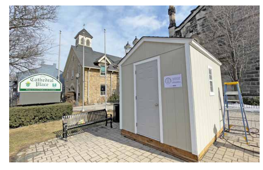
The completed shelter, a model of a better alternative to homelessness, sits in front of Christ's Church Cathedral;

In Hamilton, the city council is not as open and flexible as that of Kitchener-Waterloo, London, Kingston, and other cities where these temporary solutions to homelessness exist, so there has been little progress