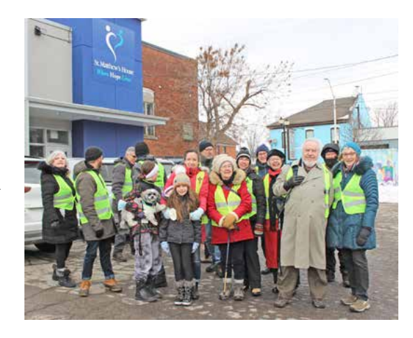
Above: Walkers gather outside St. Matthew's House to begin their walk.

Right: Walkers pose for a group shot outside 541 Eatery & Exchange, one of the agencies supported by the walkers.