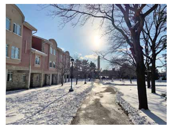
A winter morning at the University of Guelph campus during the pandemic.

For our students at the Ecumenical Campus Ministry (University of Guelph), that transformation has often occurred when we gather for Community Dinner each Wednesday. Students come in as lonely strangers, and are transformed into a community as they chat and laugh over bowls of chili. Church partners, who bring us warm crock-pots each week, become surrogate aunts and uncles for UofG students who are far from home. In a usual season, a cramped little living room in the heart of campus becomes a location of grace and grounding, as students are