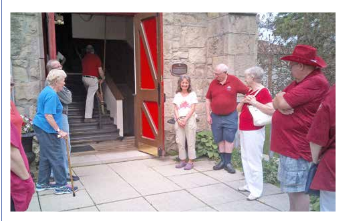
(Above) Welcoming the congregation to celebrate Canada 150.

The words of thanks and appreciation for the warm welcome expressed