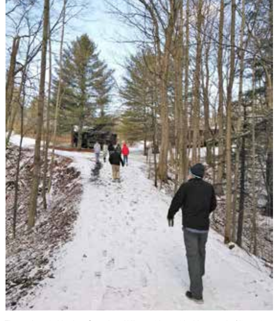
The outdoors in March at Canterbury Hills provides an ideal location for Niagara's Youth Leadership Training Program.