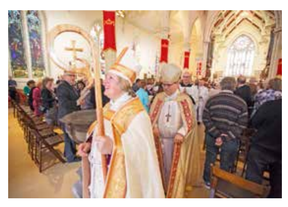
Bishop Susan leaving the Cathedral.