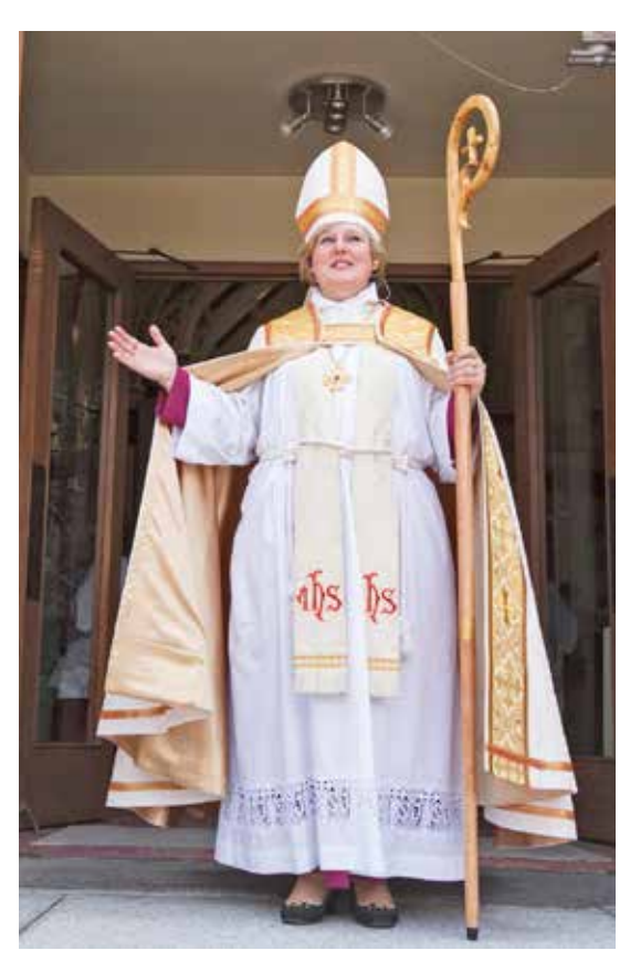
Bishop Susan Bell on the steps of the cathedral.