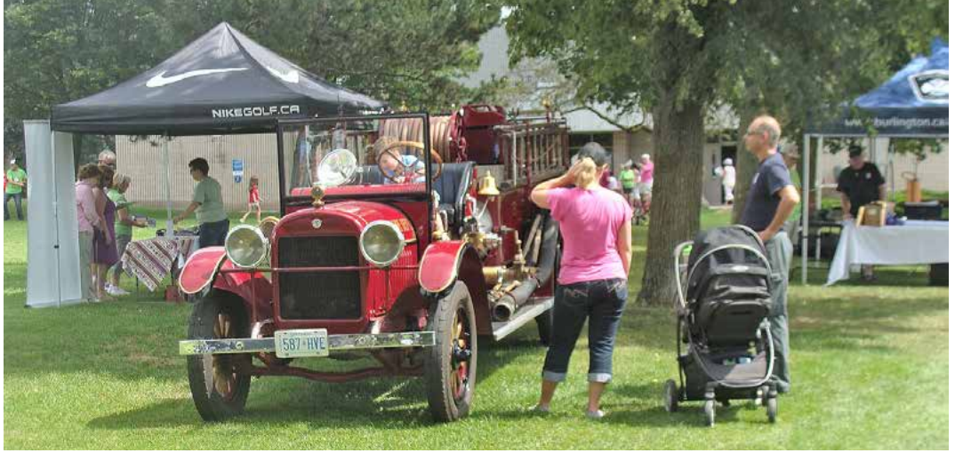
The 1923 fire truck, with its hand crank siren and open design, was a great attraction at the Canada 150 extravaganza sponsored by St. Elizabeth's Church and the city of Burlington.