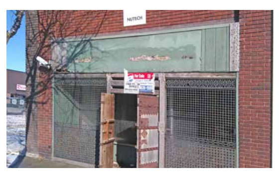
Prayer and consideration are still being given to the future purpose for this building on the property, once filled with snakes.