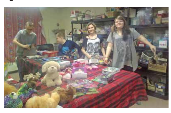
Young people at the LivingRoom—a drop-in ministry in the community of Schumacher, just outside of Timmins—sort toys sent to Moosonee Diocese from St. Michael's and St. Gabriel's in Hamilton.

The members were sorry that the toy drive for Moosonee