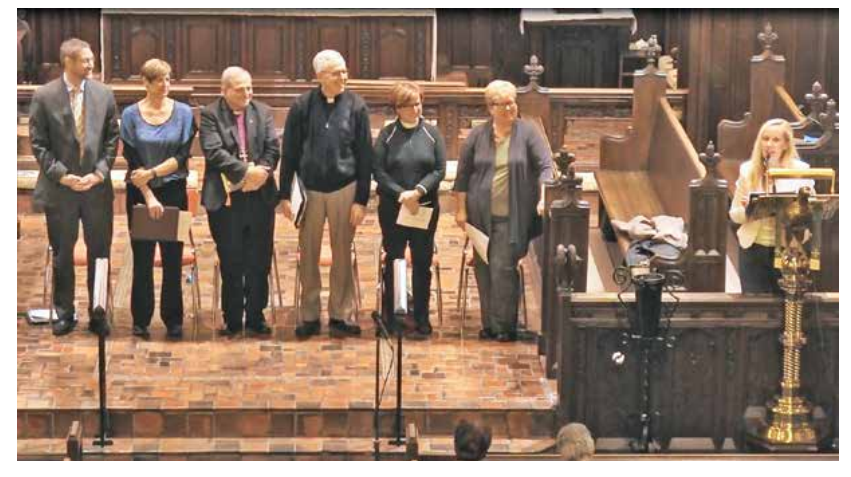
As part of the discernment process, a town hall meeting was held to garner affirmation of the report's direction and recommendations.