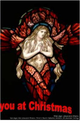
Electronic greeting card with two angels, details from Christ's Church Cathedral windows.

We have three e-cards to offer this year.