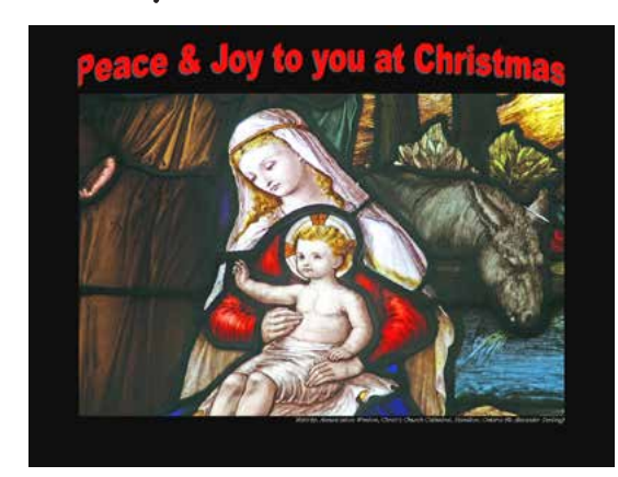
Electronic greeting card from Christ's Church Cathedral, with a detail of the Annunciation window. (see story page 8.)

Weeks later, when I walked into her home, she felt her baby