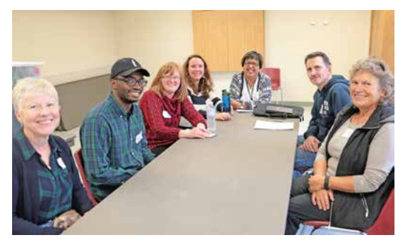
Conversation groups helped participants focus on key issues related to making a difference in Milton.

Even before the survey was conducted Grace was already very much engaged in the community, hosting a monthly