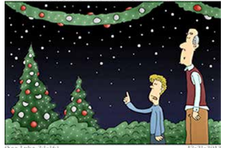
LOOK HOW MANY BABY JESUSES THERE ARE HOW DO YOU EVEN KNOW WHICH STAR