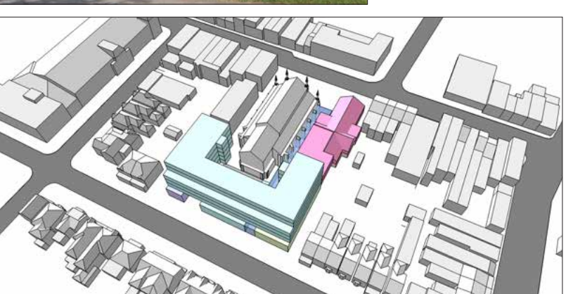
▲ Concept drawing showing the Cathedral property development. This is not an actual picture of what might be developed. Source: Architect David Premi