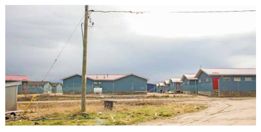
▲ 850 elementary and high school students attend Eenchokay Birchstick School, with its portable classrooms and other buildings, in the northwestern Ontario community of Pikangikum.

Pikangikum's school principal expressed delight at the possibility of getting computers donated and also asked for mittens to