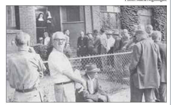
Helping the unemployed was, historically, part of the ministry of CSC. In 1963, unemployed men lined up for breakfast in Toronto

St. Mildred's College, CSC's girls school in Toronto.