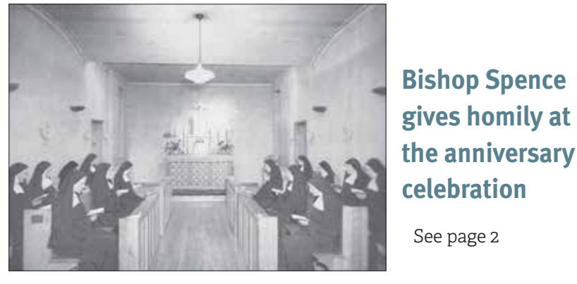
▲ The Sisters worshipping in the chapel of their original Toronto