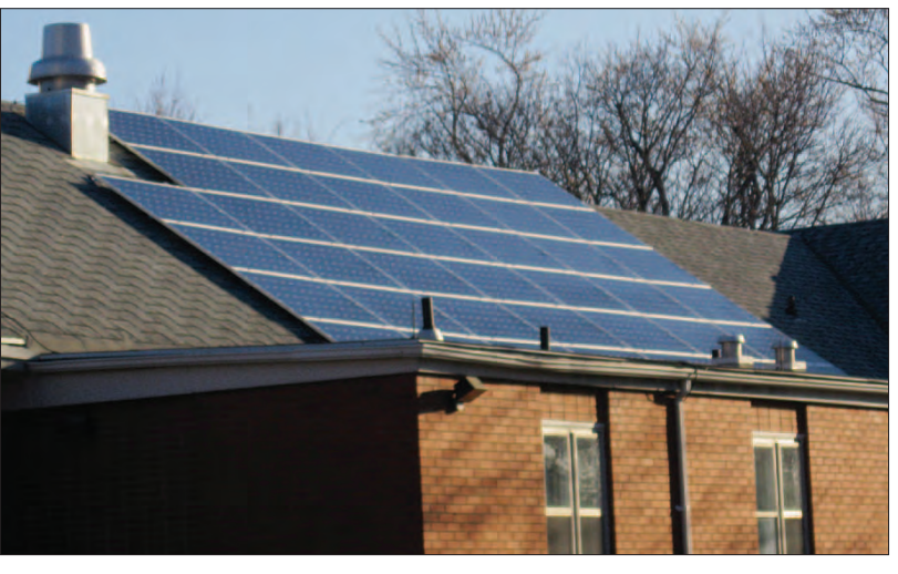
Solar roof completed at Holy Trinity Church, Fonthill

of the project life. The ultimate compliment to Trent's value came when the Inspector arrived on October 18 and was surprised that our connection passed on the first test. In the Inspector's experience that was the exception not the rule."