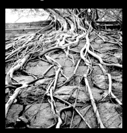
A journey through faith, life and irreverent discovery...