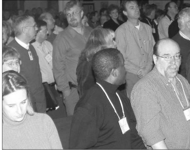
MEMBERS OF THE Synod of the Diocese of Niagara study the 2005 budget before overwhelmingly passing it at a Jan. 8 budget synod.

Motions held over from the November Synod included one to reduce DMM per-