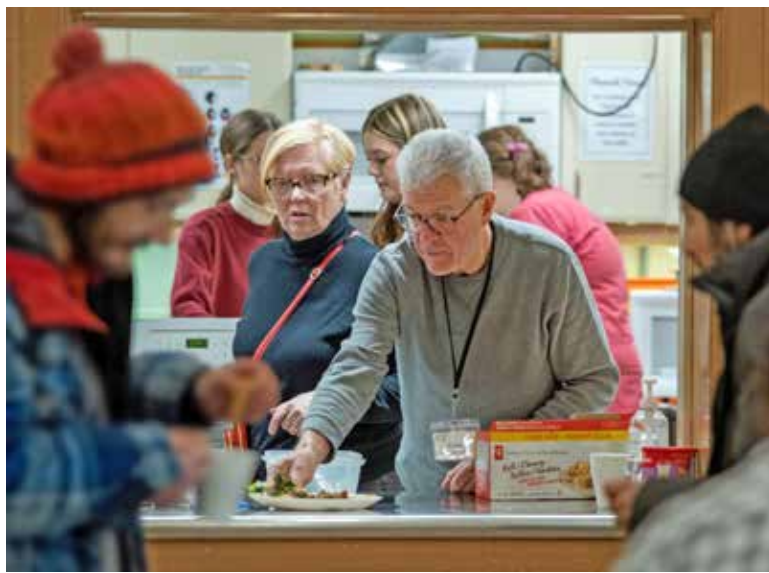
Christ's Church Cathedral in Hamilton partners with St. Matthew's House to offer a safe space in the community.

The SCM is located in a community that scores very low in Public Health's Social Determinants of Health. Many local families experience food insecurity and market guests are very diverse, including newcomers, Indigenous families, and include food drop offs at a Guelph Assisted Living building for those with mobility challenges after each Market.