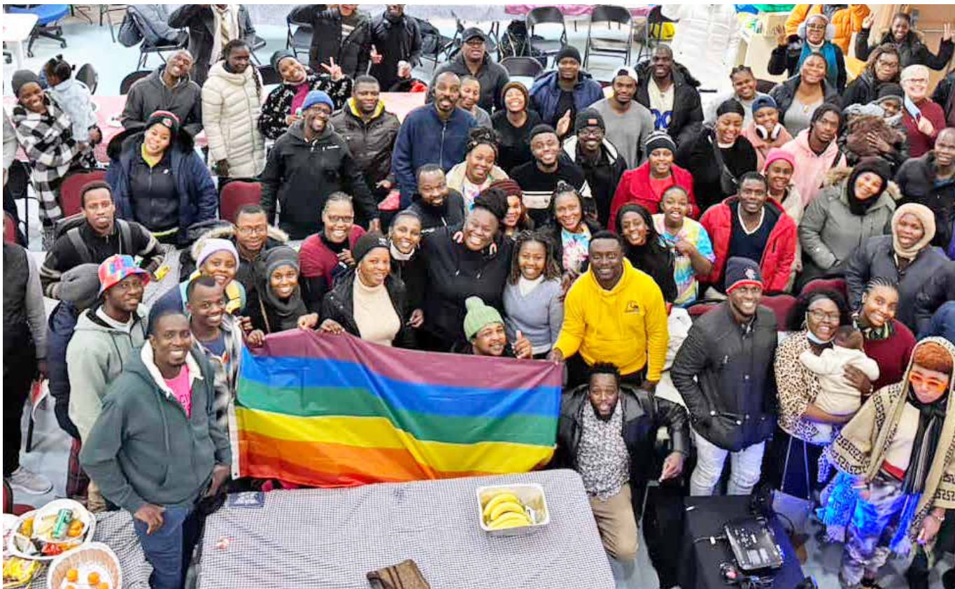
A group photo.

in the world for the LGBTQIA+ community including death. This group has allowed its members to gather and share their stories, learn together about life in Canada, and celebrate their truest selves.