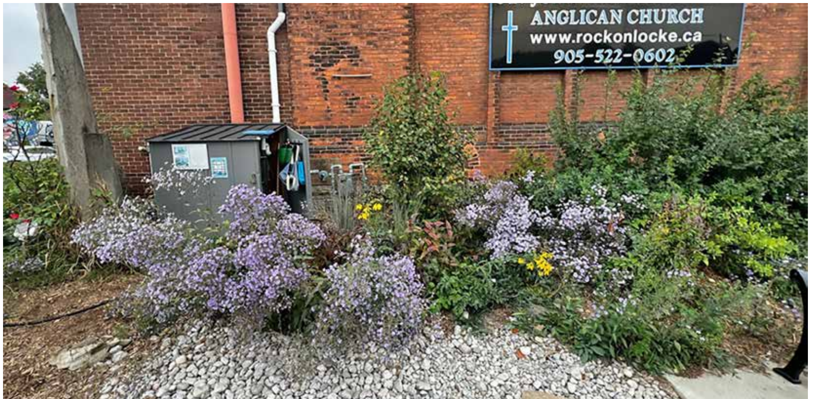
The St. John the Evangelist Stormwater Management Rain Garden is filled with native species.

The Church had rainwater seeping through the building foundation into the basement. The solution was a stormwater management garden, installed with the support of Green Venture's sustainable green