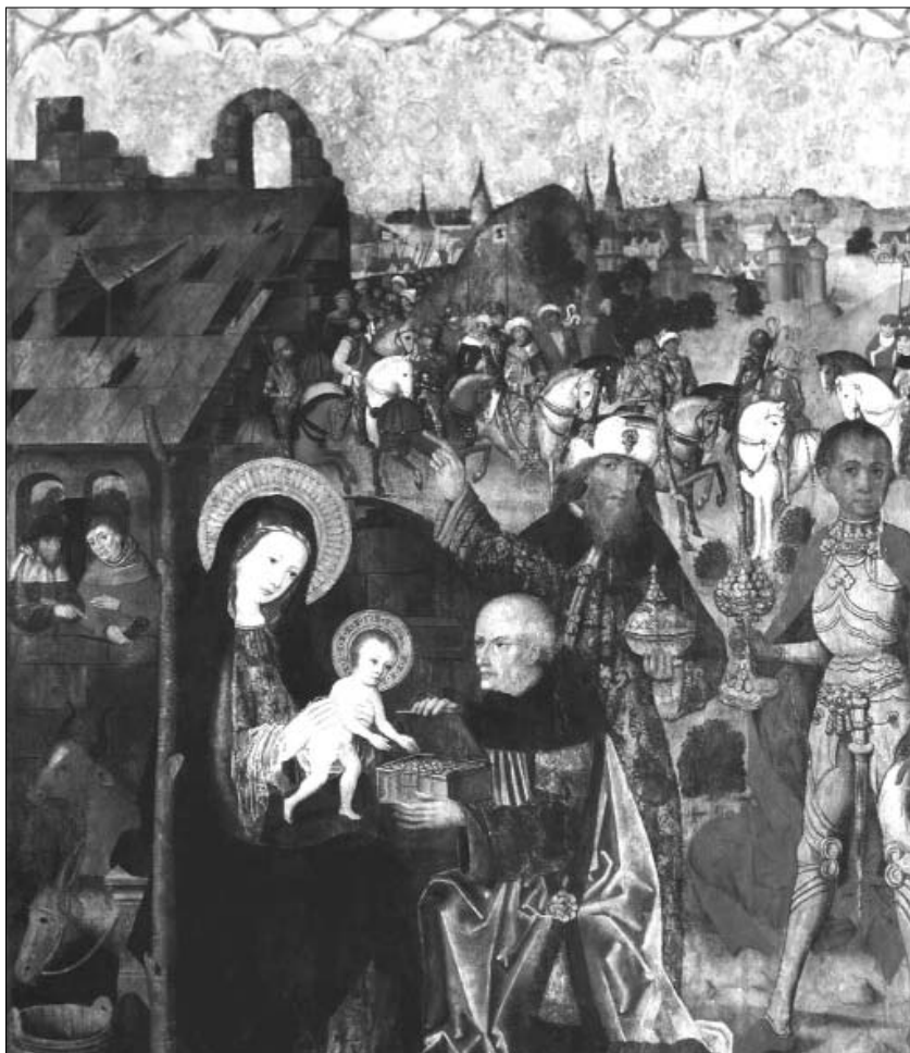
CRACOW ARTIST IMITATOR of Hans Pleydenwur's "The Adoration of the Magi", tempera on wood, c. 1480, National Museum in Poznan