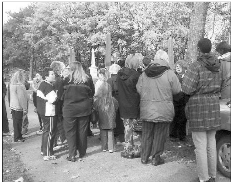
PARTICIPANTS IN THE UNDERMOUNT Saints gather in Hamilton Cemetery on Nov. 1, All Saints' Day, to take part in an educational and spiritual journey.