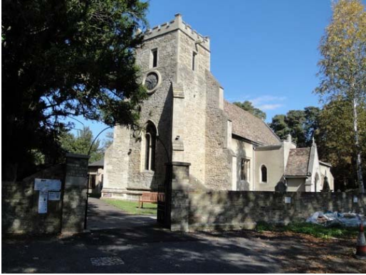
All Saints' Milton – Ancient

For more information visit www.allsaintsmilton.com