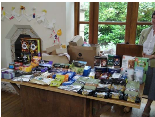
Fairtrade Market after Church