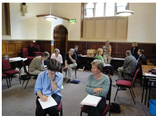
Thinking about the future of Messy Church.