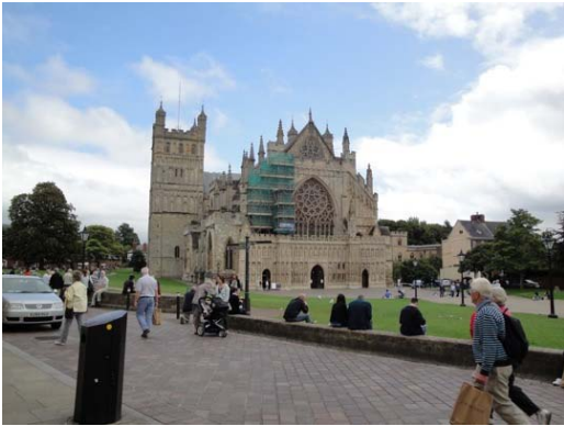
The Cathedral Church of St. Peter in Exeter – exterior