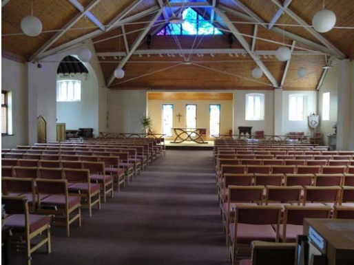
Worship space at St. Wilfred’s Church

We are looking forward to attending a national UK Messy Church conference on September 14th and 15 th so will report on that later! For more information about Messy Church (and a brief video from St. Wilfrid’s), please visit www.messychurch.org.uk