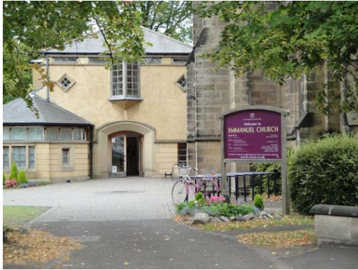
Emmanuel Church & addition Loughborough