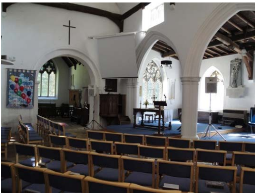
All Saints' Milton reconfigured worship space – Future