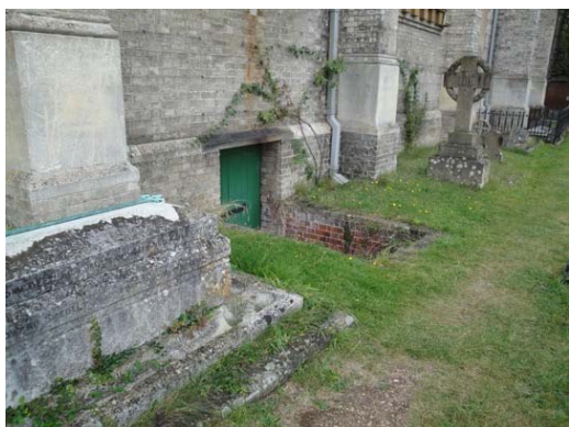
Door to the Crypt – Youth Centre