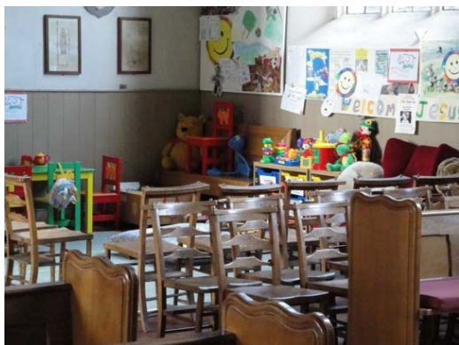
Nursery at rear of church