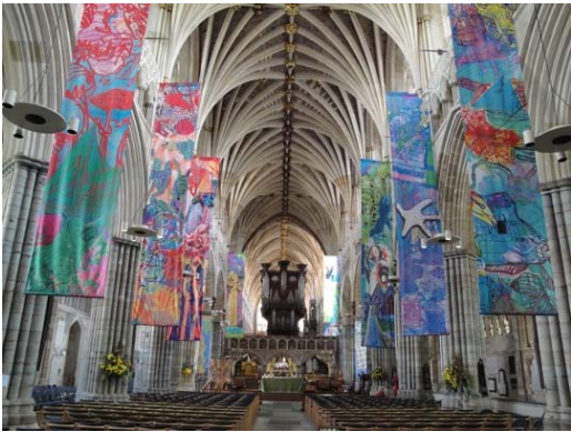
The Cathedral Church of St. Peter in Exeter – interior where Night Church takes place