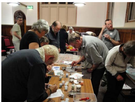
Experiencing Extreme Crafts.