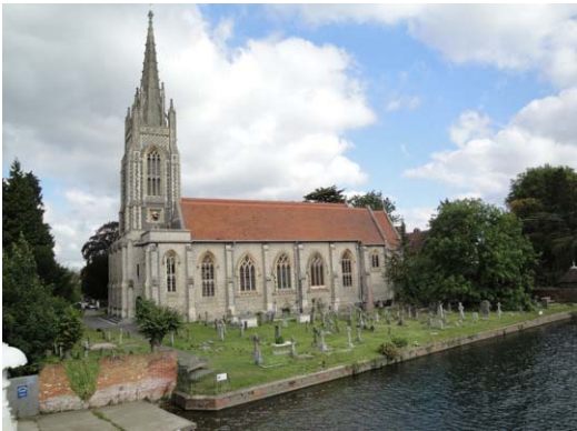
All Saints Church Marlow

For more information check out www.allsaintsmarlow.org and www.morethansunday.co.uk