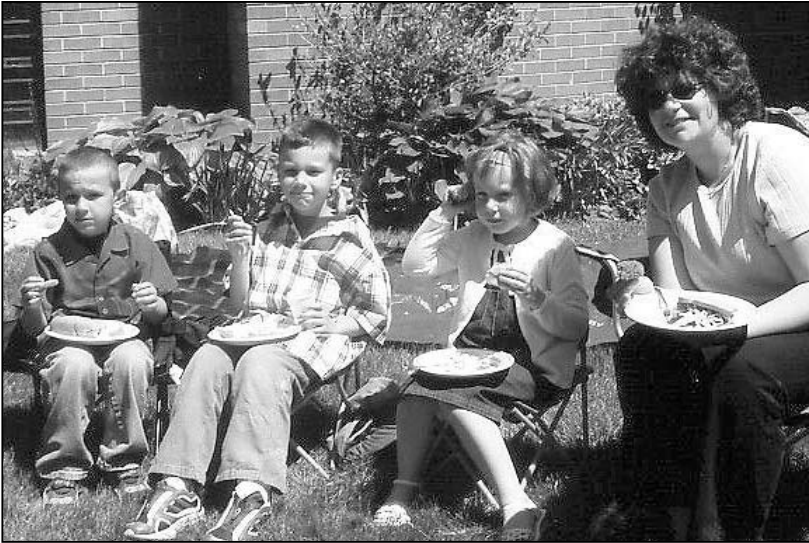
FAMILIES CAMPED AROUND St. Michael's Church in lawn chairs during the annual picnic.