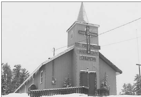
ST. MATTHEW'S CHURCH, in Kingfisher, Ontario, Diocese of Keewatin.