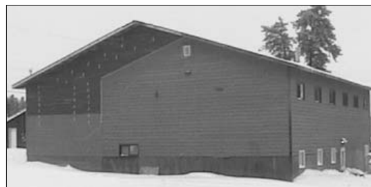
THE DINING HALL at Big Beaver House Camp doubled as a chapel.

Although this wasn't his first visit to Keewatin - he's attended