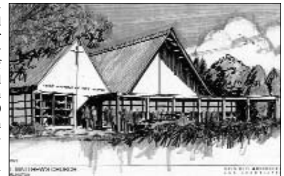
AN ARTIST'S RENDERING OF St. Matthew's on-the-Plain with new addition. Designs by Gren Weis Architect and Associates.