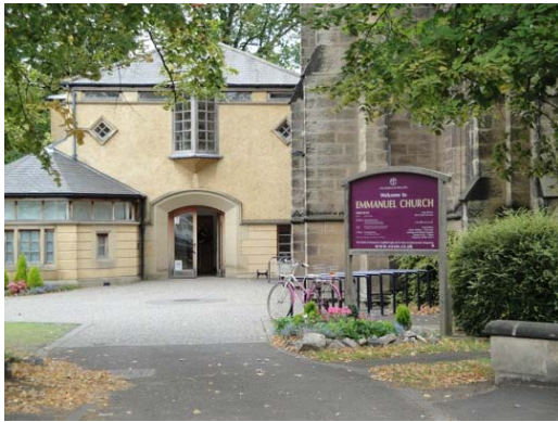
Emmanuel Church & addition Loughborough