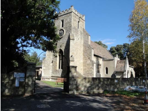
All Saints' Milton – Ancient

For more information visit www.allsaintsmilton.com