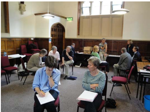
Thinking about the future of Messy Church.