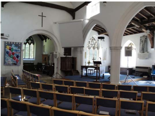
All Saints' Milton reconfigured worship space – Future